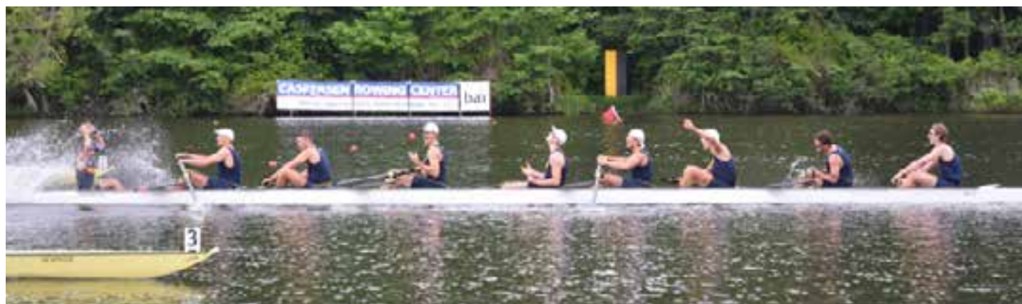
Varsity 8+ crossing the finish line in 1st becoming National Champions