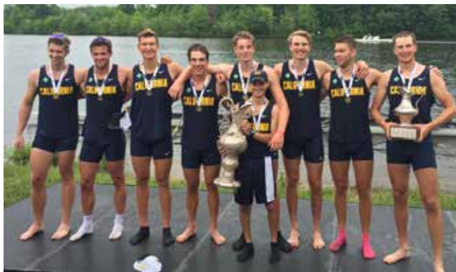
Varsity 8+ with their gold medals

As the week goes on, the team moves to the race course. The transition happens usually the day before the heats take place. This Thursday was no different except Yale was ranked #1 coming in. After winning San Diego and Eastern Sprints, it was a deserved ranking and everyone knew that Yale would have a very fast crew. As all of the other crews prepared for the heats, the freshmen had to continue to train as their race was not until Sunday. With a dwindling freshmen field, it was only one race for the young Bears. To start the weekend, the Varsity had their first race on Friday. They got off to a good start and lead the heat wire to wire. Their rate was low but very aggressive. They rowed with confidence and knew it would set a tone for the rest of the crews