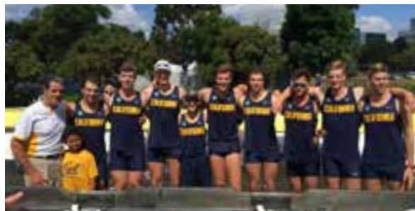
The Varsity 8+ after their victory at the Washington Dual