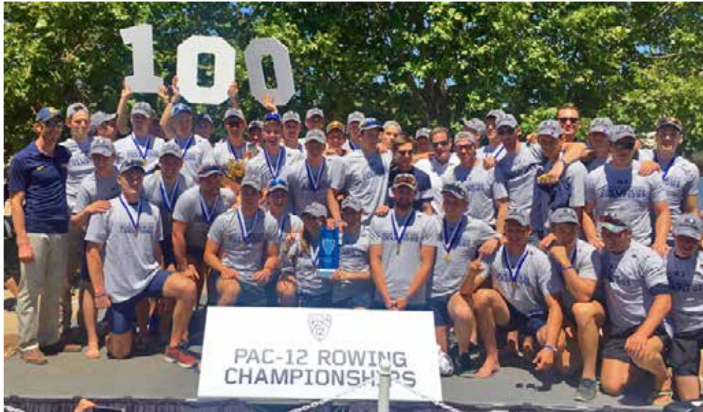
The entire squad being crowned PAC-12 Champions at Lake Natoma