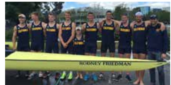
The 2nd Varsity 8+ after their victory at the Washington Dual