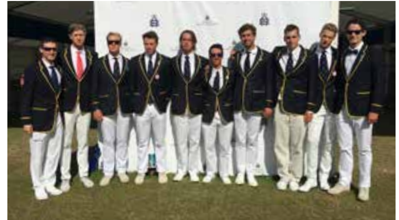
Temple Cup 8+