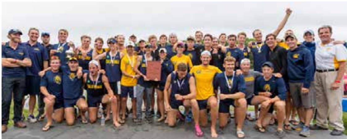
The entire squad receiving the Ten Eyck Team Trophy

As Saturday kicked off, there were already fears of weather. Officials changed the schedule on Friday to shorten the day with the forecast of afternoon thunderstorms. While the storms never showed, the weather didn't slow down the Bears. In the semi-final, the Varsity lead from the start and held a similar rate as Friday with confidence and power. The JV also was getting healthy from some illness and looked to be prepared for Sunday. The 3V snuck into the grand final by one second and Cal had once again put all their crews in every grand final for the fifth year in a row.