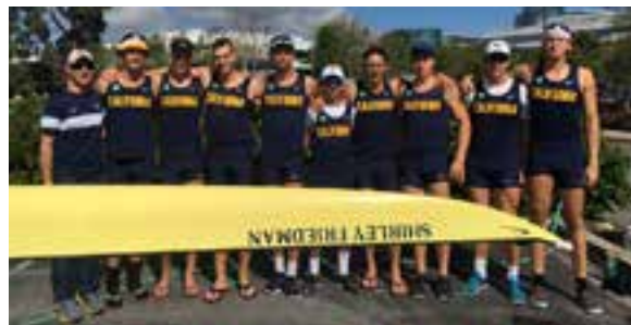
The Freshman 8+ after their victory at the Washington Dual