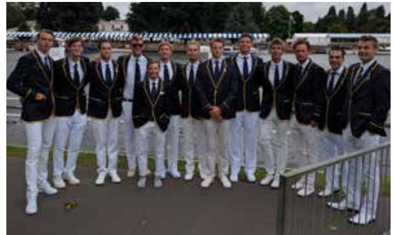
Ladies' Plate 8+ and Visitors' 4-